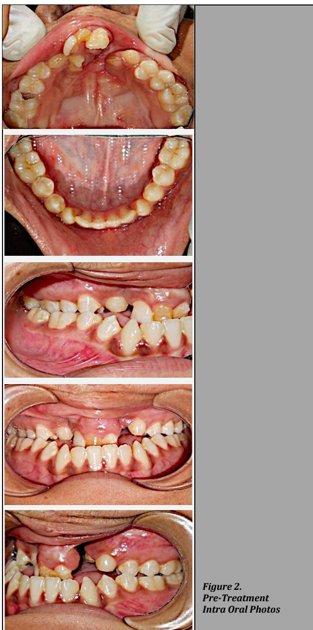
Figure 2. Pre-Treatment Intra Oral Photos

Thus, a multidisciplinary team approach including orthodontists who aid with reverse orthodontics or decompensation prior to surgery as a preoperative procedure is of utmost importance. In approximately 25 - 60 % of all the patients exhibiting deformities of the cleft lip and palate, surgical intervention is necessary to improve not just facial aesthetics, but also to restore normal functions of the oral cavity. 6