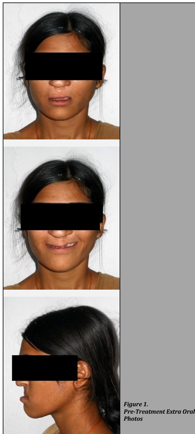
Figure 1. Pre-Treatment Extra Oral Photos

There is an increased stability and growth of maxilla over time when distraction osteogenesis is utilized as a modality in growing patients as was demonstrated by Rachmiel et al. 4